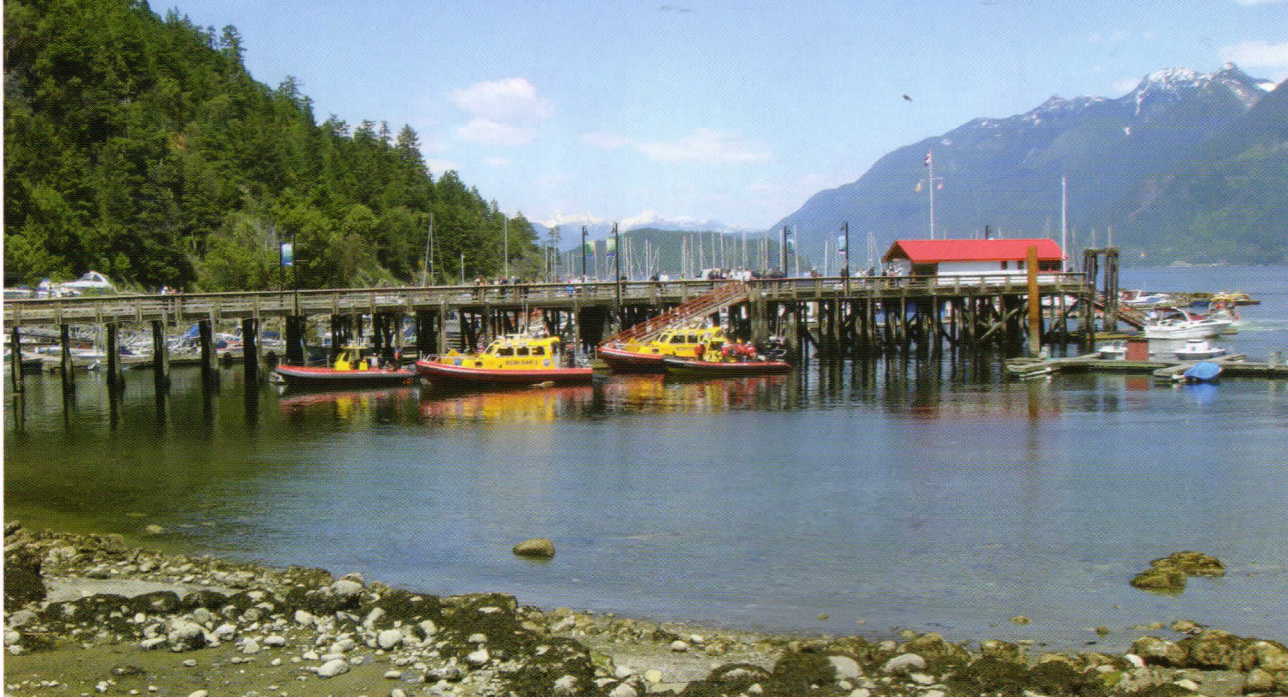
RCN-SAR vessels from around the Lower Mainland gathered in Horseshoe Bay for the dedication of the new Station 1 building (red roof) and new RCM-SAR 1 vessel CRAIG REA SPIRIT (alongside the wharf, at foot of ramp).